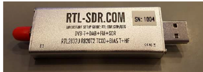
Figure: Simple USB SDR