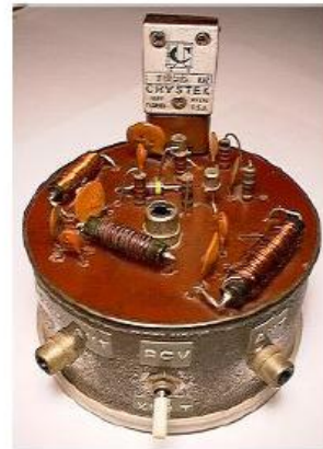
Figure: QRP Classic!