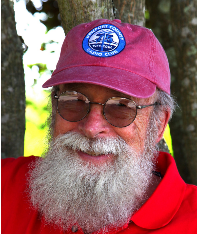
Hat without callsign $30