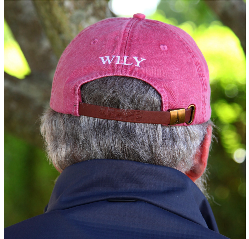
Hat with callsign $35