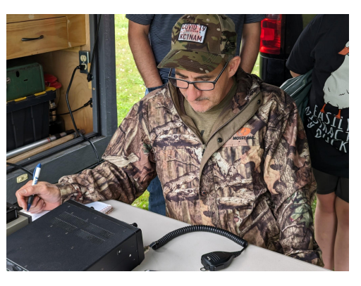
June 24, 2023 Field Day Demo