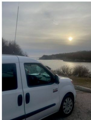
POTA K-2875, Fort Wetherill, Jamestown, RI

Mark your calendars for this major opportunity to make a clean sweep of all RI parks - including Block Island and other seldom activated references in our much sought after, small state. (41 of the 52 POTA parks in RI have been activated less than 50 times ever.)