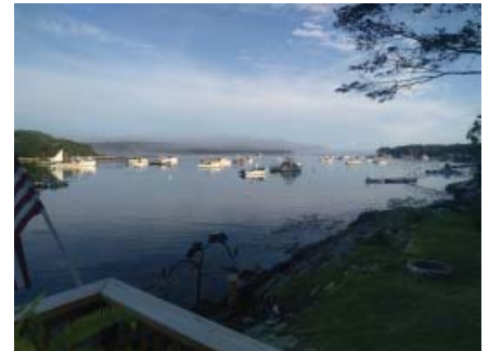
Morning light on Cundy's Harbor

Snow Island is the 25th island that NCRC has activated since we started activating islands in 2014.