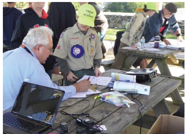
NCRC volunteers at the review tables

After the opening class, Scouts will visit the Requirement Review Tables staffed by NCRC volunteers. As the Opening Class ends, review volunteers will organize themselves at tables so that each requirement will be reviewed at one table by one or more volunteers. At the conclusion of each interview, the Scout will move on to a different table.