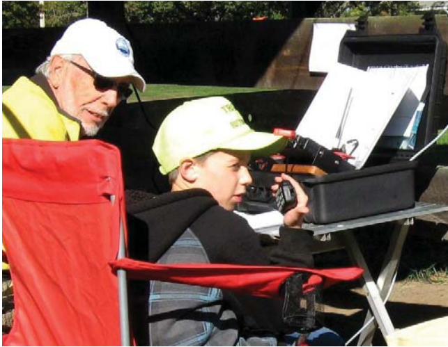
QRV at Glen farm

The candidate will have an opportunity to visit and operate several ham radio stations during the JOTA weekend, thereby completing Requirements 7 and 9 and reinforcing the ideas of Requirement 4.