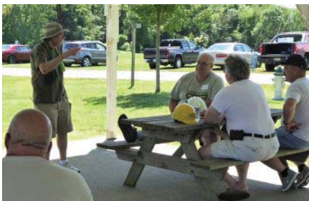
WA1ABI Field Day safety briefing