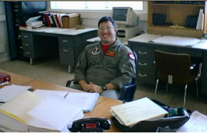
Back in the day