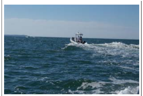
Heading down Vineyard Sound

Now at the bottom of Solar Cycle 24, we don't expect the multi-hundred contact days that were typical of a few years ago, but we always handily meet the US Islands qualification requirements. Most of all, each evening is filled with outrageous tales that happen to be true. For example, the day last year that a line of bulls sauntered along behind our station on Nashawena Island.