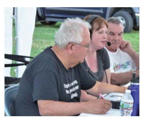
GOTA Station with new operator and coaches

Our Phone and CW stations will be staffed primarily by experienced high-speed operators, but our Field Day is not limited to experienced hams. We've shown repeatedly that NCRC can keep up with the best of them and now we are more interested in helping new and returning hams find a home in Amateur Radio. New comers will be at ease with the relaxed pace at the VHF and Satellite stations. And then there is the Get On The Air—GOTA—station that is specifically dedicated to introducing new and prospective hams to operating HF.