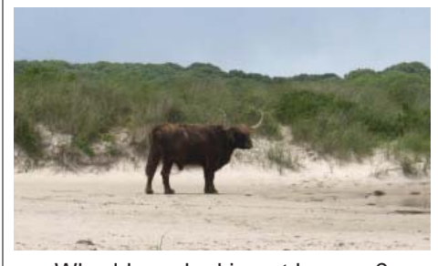
Whadda ya looking at hammy?

Now at the bottom of Solar Cycle 24, we don't expect the multi-hundred contact days that were typical of a few years ago, but we always handily meet the US Islands qualification requirements. Most of all, each evening is filled with outrageous tales that happen to be true. For example, the day last year that a line of bulls sauntered along behind our station on Nashawena Island.