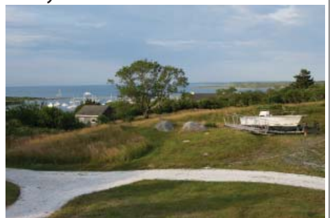
Morning on Cuttyhunk

Our support vessels, Goblin and Barbara E will again work out of Cuttyhunk.