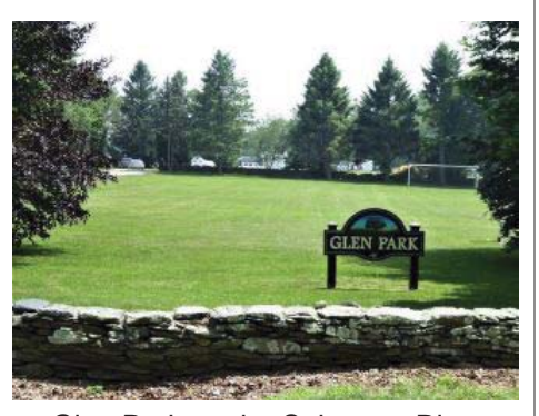
Glen Park on the Sakonnet River

Conceived as an emergency communications drill, the goal is to work as many stations as possible on the amateur radio bands. NCRC will operate in the most popular and competitive category, 2A. Typically there are some 400 entrants in 2A,—many of whom are long-time perennial competitors. For a modest-sized club, NCRC fares exceedingly well, typically we rank in the Top Ten of the 2A category.