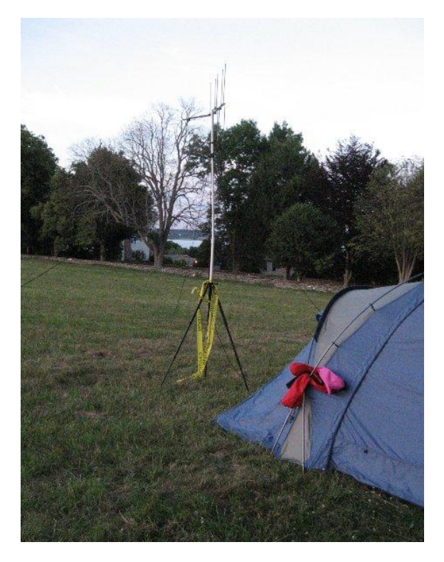
And short ones too