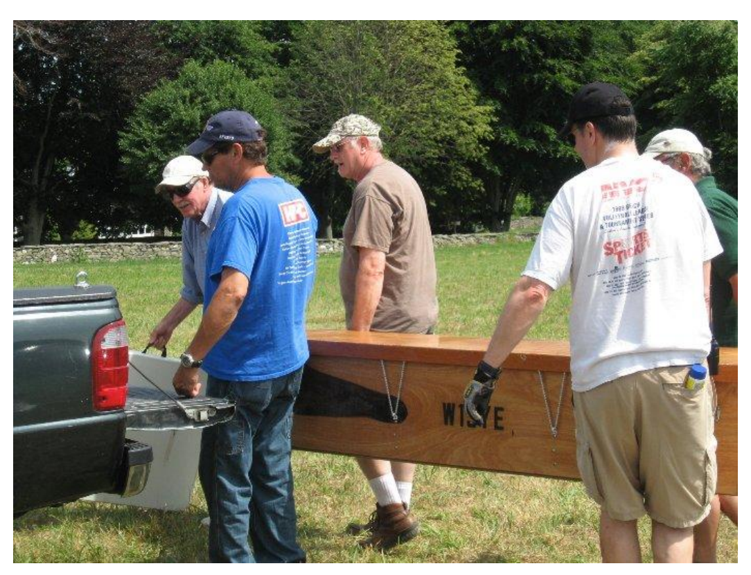
Fresh ideas for next year's tweaks were stirring.