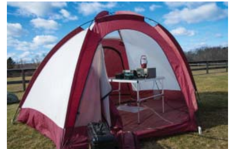
Typical station tent

The stations are reasonably comfortable in their tents with good light and an electric heater. Logging will be done on paper, so there is no software to be mastered.