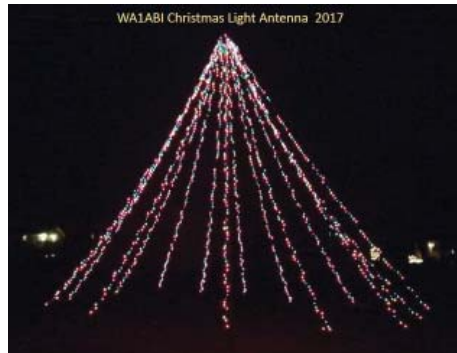
The 80 meter CW Christmas Tree