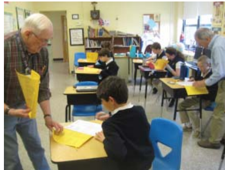
Exams underway at AS 2 A

On May 2 nd , eight AS 2 A students, ranging from fourth through eighth grade sat for their exams.