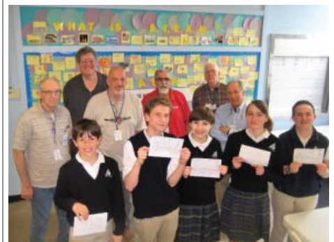
Smiling TECHs and VEs

All five TECHs have elected to become Junior Members of NCRC and were voted aboard at the May meeting. They have elected to exercise the two-year option and gain a Baufeng HT, so keep a sharp watch for young voices on the W1SYE repeater.