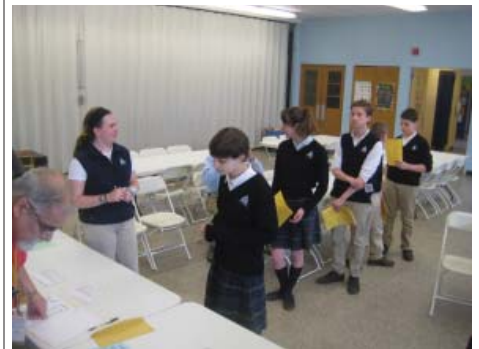
The moment of truth

All five TECHs have elected to become Junior Members of NCRC and were voted aboard at the May meeting. They have elected to exercise the two-year option and gain a Baufeng HT, so keep a sharp watch for young voices on the W1SYE repeater.