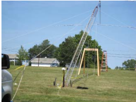
Note the rusted top section

In reviewing our equipment for Field Day, we discovered that several of our tower sections had deteriorated over the winter. Unfortunately, because they no longer met our safety standard, they had to be condemned.