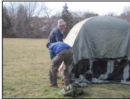
Setting up on green grass.

The February Modulator reported our first effort at Winter Field Day—think Field Day in January. Fortunately the mild winter allowed us to ease into this unknown territory.