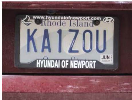
Type 18 Registration Plate