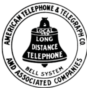
Bell logo from 1900

Ever notice that graphic styles change over time? Remember this one? If so, you have some serious mileage under your shoes.