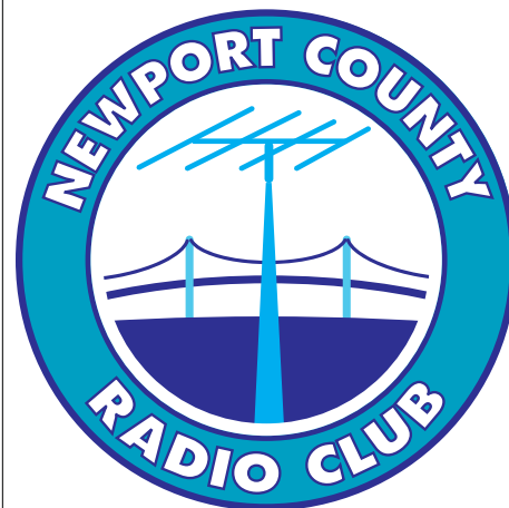
The new NCRC logo