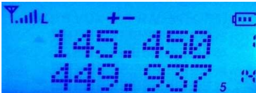
LCD: HT in Memory Mode (see #s on right)